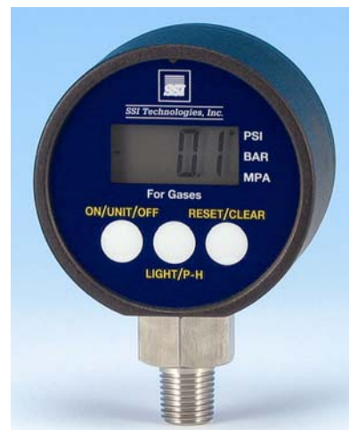
MediaGauge™ Model MG-9V and Model MG-9V-F

The MediaGauge™ MG-9V digital pressure gauge has better accuracy, longer life and standard multiple functions which make it a better choice than mechanical pressure gauges.