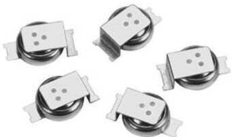
Surface Mount Device