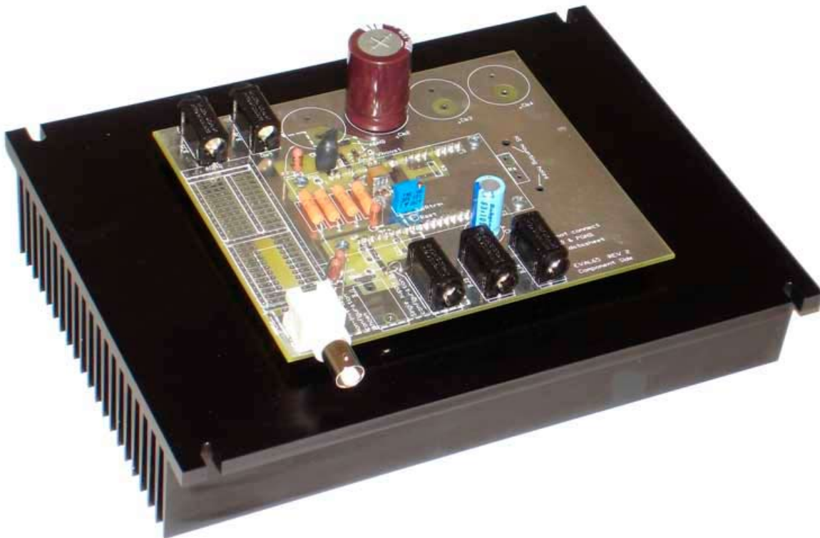
FIGURE 3 - EK65 Assembly