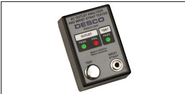
Figure 2. Desco 98131 AC Outlet Analyzer and Wrist Strap Tester