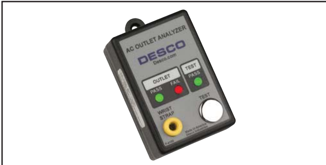
Figure 1. Desco 98130 AC Outlet Analyzer and Wrist Strap Tester