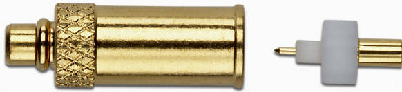
Model 73034 MMCX PLUG STRAIGHT SEMI-RIGID, RG402

Snap-on coupling and micro-miniature size for fast connect and disconnect where space is limited