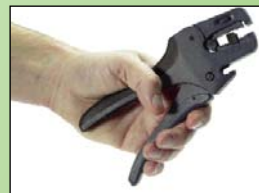
Ergonomic design with non-slip two component handles