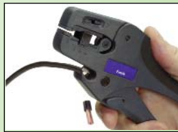
Cuts & strips up to 10mm²/8 AWG - Strips PVC, THHW, TEFLON insulations