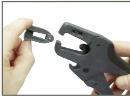
Interchangeable stripping blade cassettes