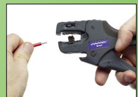
Easy/snag free wire removal from tool - jaws stay open after strip