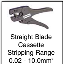
Straight Blade Cassette Stripping Range 0.02 - 10.0mm²