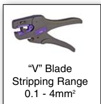
"V" Blade Stripping Range 0.1 - 4mm²