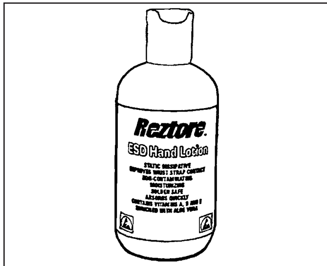
Figure 1. Reztores™ ESD Hand Lotion, Item No. 35660, ready-to-use 8 oz. bottle