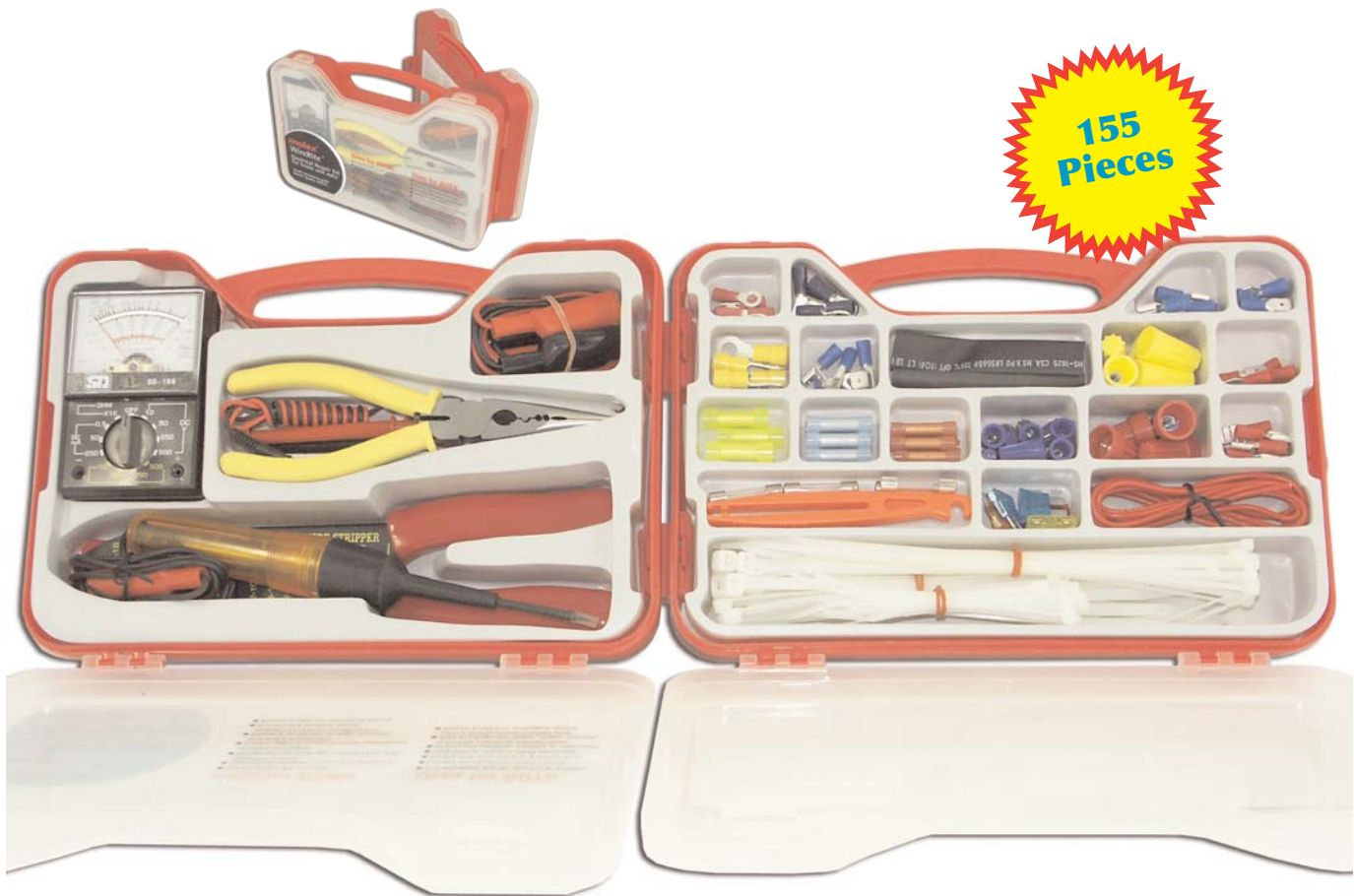
Kit No. 19413-0065 WireRite Electrical Repair Kit.

For Home and Automobile Applications. Troubleshoots both AC and DC Circuits. Determine whether Circuit is Live Before Attempting Work. Repair Wiring in Lamps, Ceiling Fans, and Fluorescent Lights. Safely Replace Fuses in Small Appliances. Replace Terminals on High Vibration Appliances like Air Conditioners. Bundle and Protect Wiring. Repair Broken or Damaged Wiring. Locate an Electrical Short Circuit. Safely Find and Replace OEM Terminals. Determine whether Battery or Alternator is Bad by Checking Voltage Drop. Repair Broken or Damaged Wiring.