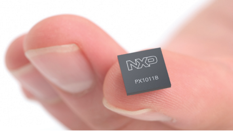
PX1011's small package fits into applications of various sizes